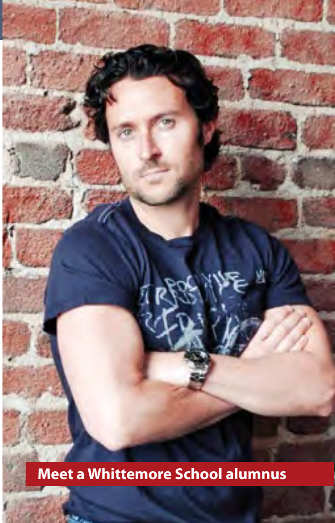
Meet a Whittemore School alumnus

Building great teams to create engaging consumer products. Tickle grew to 200 million users before Monster bought us for $100 million in 2004. In the last year, BranchOut raised $24 million in venture capital. The best advice I can offer, especially to students, is to work hard, be smart, and have a good attitude. If you do that, people will mentor you.